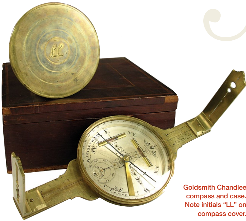
Goldsmith Chandlee compass and case. Note initials "LL" on compass cover.