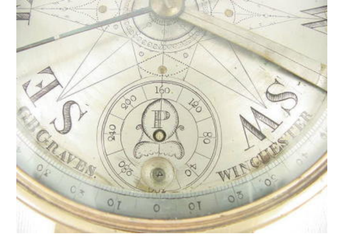
Please scroll down and check for revisions.