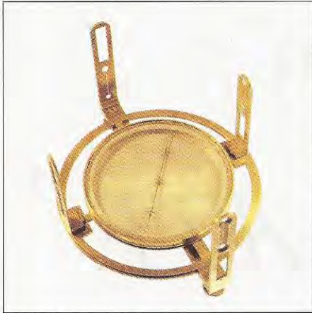
Figure 1 Common theodolite

A circumferentor is more commonly referred to as a surveyor's compass. The reference angles are to be read from the degree scale within the compass box relative to the magnetic needle. The sighting is accomplished via two sight vanes at either end of the alidade, oriented on the north-south line (Figure 3).