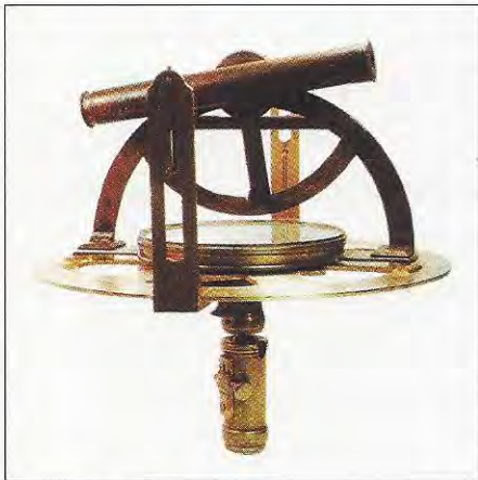
Figure 2 Telescopic theodolite

Generally speaking, brass instruments produced in the Colonies were quite rare until the middle of the 18th century. Rowland Houghton's "theodolite," patented in 1735 in Massachusetts, is the earliest brass surveying instrument to be patented and documented. In his book With Compass and Chain , historian Silvio Bedini traces the history of the patent given to Houghton in 1735/36 by the Massachusetts Bay Colony. According to the Act recorded in its Acts and Resolves II , Houghton's instrument was designed "for surveying of lands ... with greater ease and dispatch than any surveying instrument heretofore projected or made within this province." There were many circumferentors and semi-circumferentors primarily constructed of wood during this early period, but Houghton was able to obtain a patent due to the accurate simplicity of the design of his instrument.