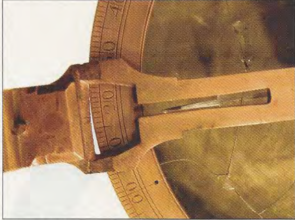
Figure 5 This slit and window assembly has proven over time to be a structural weak point. Notice the compass needle viewed thru the slit.