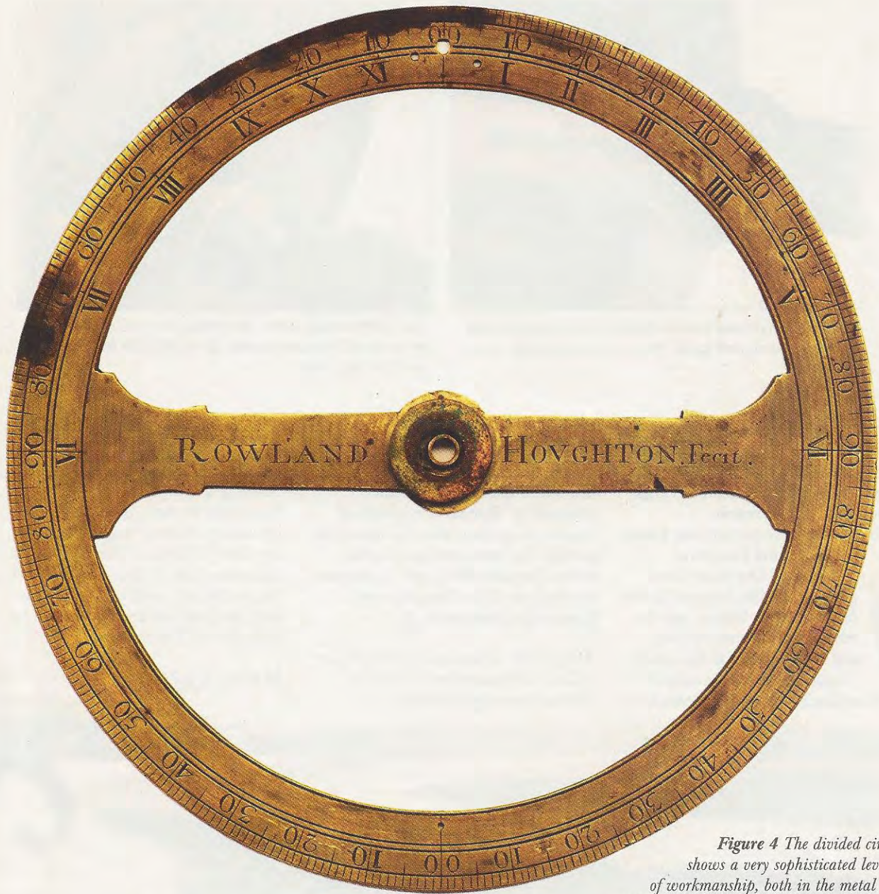
Figure 4 The divided circle shows a very sophisticated level of workmanship, both in the metal work as well as engraving and division.