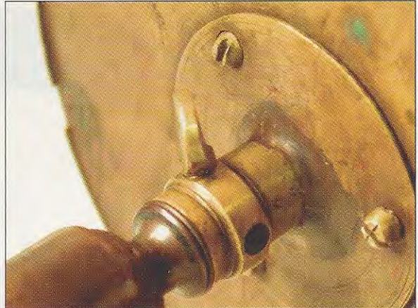
The socket assembly shows the typical diminutive size of the early colonial instruments with the socket plate being made of very thin sheet brass.

the horizontal scale can be rotated to true north, allowing all future readings to be adjusted for variation.