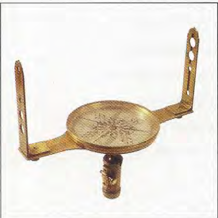
Figure 3 Circumferentor or surveyor's compass